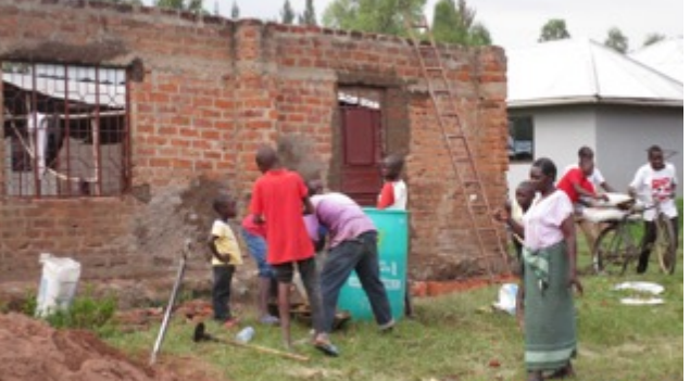
The unfinished building