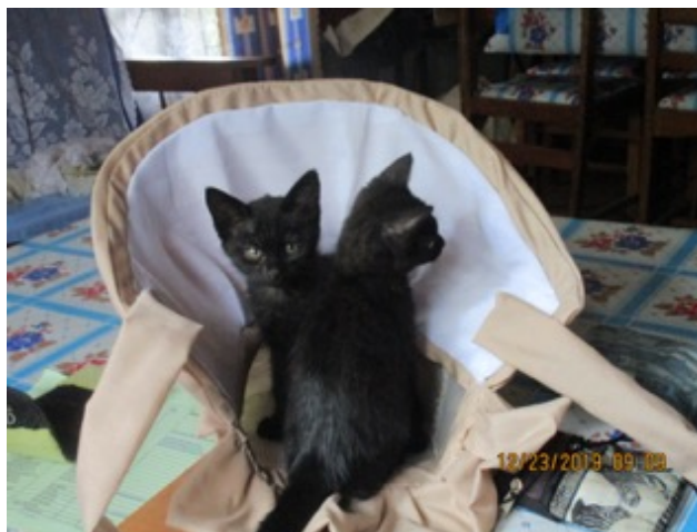
A bonnetful of kittens